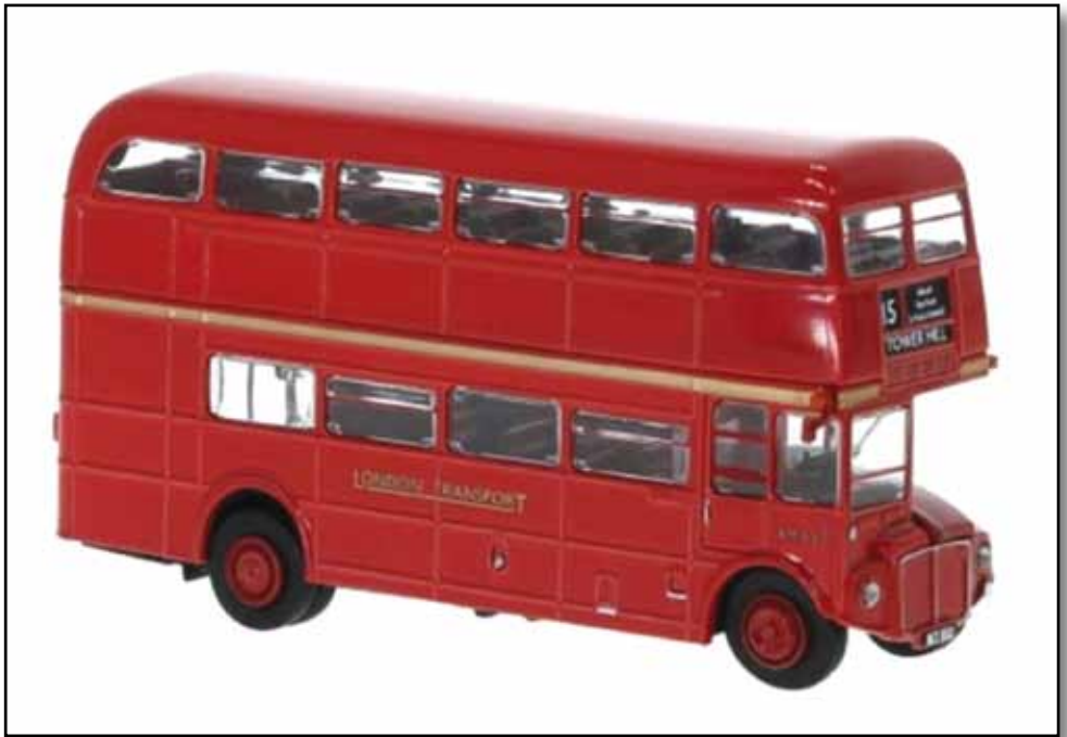
These 1/87 scale Routemaster buses are due shortly from Brekina Modellspielwaren - see page 57 herein.